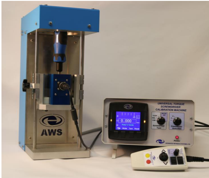
Photo above shows a UTSCM with Control Box, Handheld Controller, and an Intelligent Inline Torque Transducer.